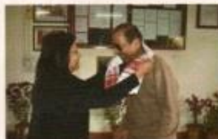
VISIT OF RETD. OF LT GEN GYAN BHUSHAN, AVSM, VSM, FORMER PATRON-IN-CHIEF APS TEZPUR