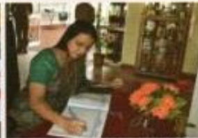
VISIT OF ZONAL PRESIDENT AWWA 4 COPRS