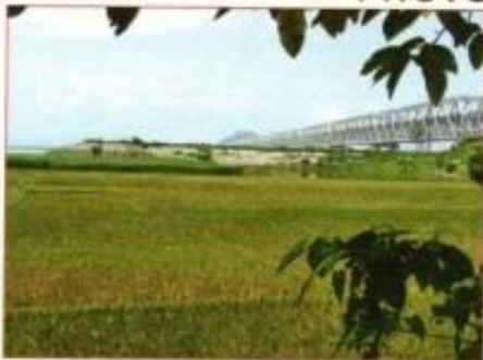
Eshahnur Alam Ara VIB