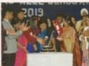
FAREWELL CLASS XII