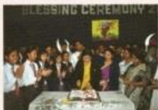
BLESSING CEREMONY CLASS X

The Final Exam of the Academic Session 2018-19 will be organised from 1 st March – 15 th March, 2019