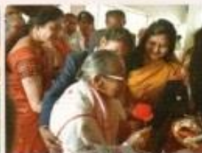
GRAND PARENTS MEET